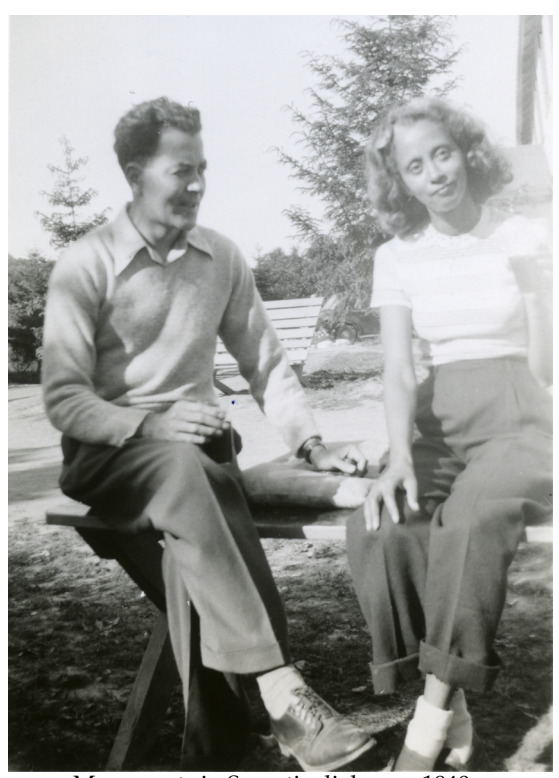
My parents in Socratic dialogue, 1940s

Keywords: Yoga; Vedānta; Sāmkhya; Vedic philosophy; Spinoza; LSD; art; Kant; Hume; behaviorism; Rawls; metaethics; decision theory; Humean; Kantian